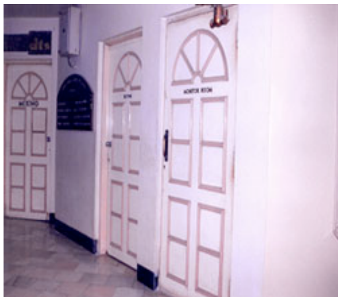
Classic Bollywood "old world" charm – Monogrammed Mixing, Editing and Monitoring Room doors within Mumbai's famous Empire Studio's Building