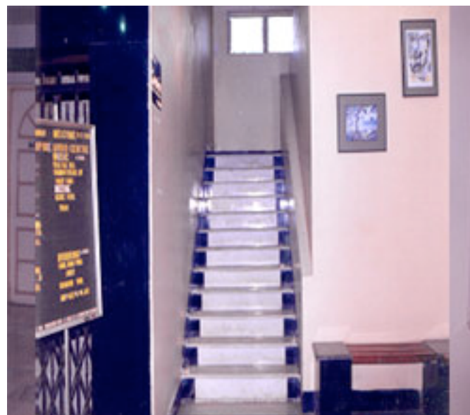
Beautiful marble staircase at Empire Studio Building entrance

Owned by Mushtaq Nadiadwala and Feroz Lakdawala, the Empire Studios facility also has a film mixing stage featuring a Pro Tools Mix 3 system on the ground floor, and on the second floor is an additional music studio called Sound City that uses a Pro Tools Mix 3 system.