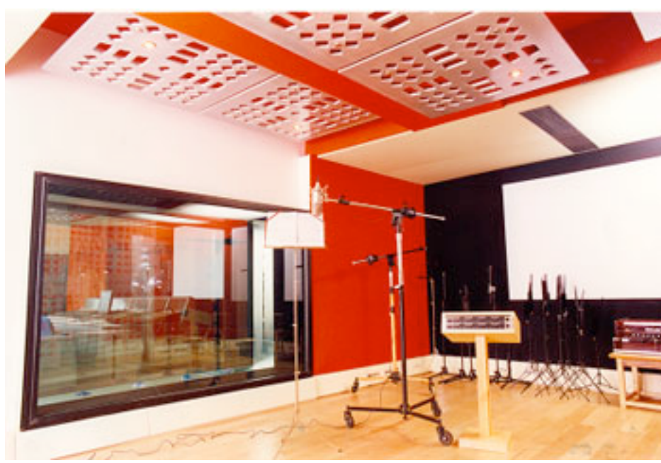
Impressive space where Veer Zaara recording took place

"We could only dare to think about such a technologically challenging project because we had ProTools HD3 in our studio."