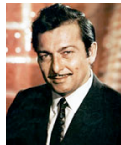
The late Madan Mohan